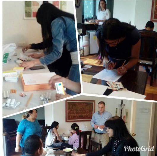
Photo: We are helping with the distribution of medicines and the packing of the boxes which were sent to the Lutheran churches of Venezuela (ILV).

We thank all the individuals who have helped support and make possible this project of sending medicine to Venezuela.