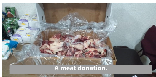
A meat donation.