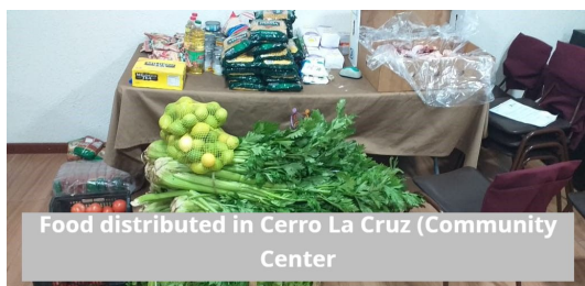
Food distributed in Cerro La Cruz (Community Center)