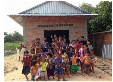
Immanuel Lutheran Church Snor

"The joy of the Lord is your strength." Nehemiah 8:10