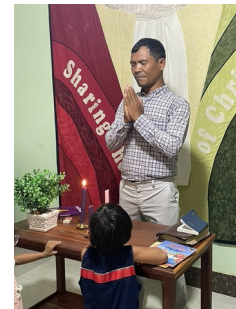
Advent Week one