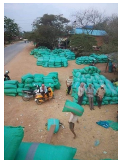
Rice gathering center

these weeks. (the real younger ones sometimes are a bit adventuresome, and so there are attempts by the older ones to 'pinch' them into obedience and submission. Trust me, it doesn't always work, but I look at the determination in both camps to do whatever is in the moment. I just am available to grab those church books from littles who are adept at destroying those pages in a blink of an eye, no less.