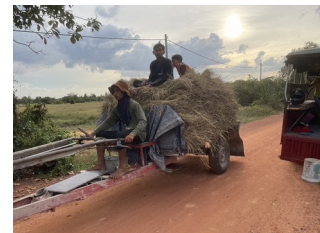
Hauling the rice stalks