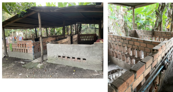
This is how the pig farm may look.