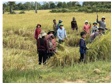
Many hands make light work...maybe. Shared yes!