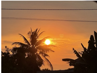
The Glory of God