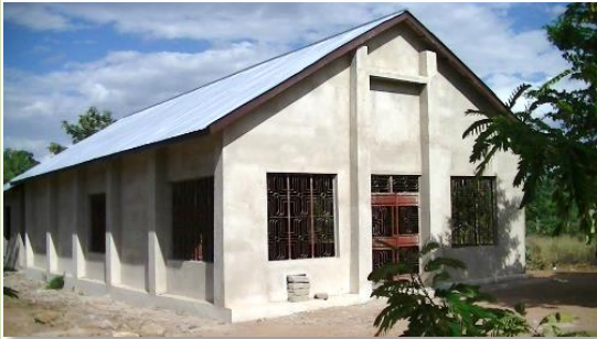
New church building in the Kesesa mission area.