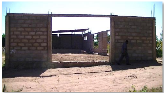
Church building in construction in Usagala mission area.

of meeting the spiritual yearnings and spreading the Gospel to these rural dwellers. Out of the forty (40) congregations of the Lutheran church in Mwanza (ELV diocese) only nineteen (19) trained pastors are available to cater to the Lutheran congregations, and seventeen (17) evangelists are still undergoing training. What this means is that, there cannot be church planting or evangelism due to lack of man power. One important thing I noticed in Mwanza is how receptive the people are to visitors. They are eager to hear and be taught the Christian life. They want to know Christ but have no means to do so. The ground for harvest is ripe in Mwanza but the labourers are very few.