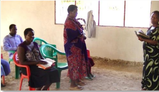
Some members conducting Bible study with no pastor.