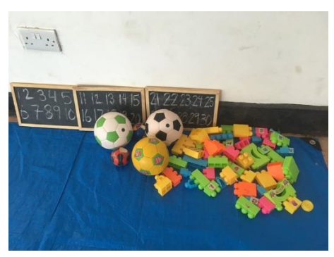
Because of our generous supporters, we were able to purchase some toys and supplies to get the daycare started.