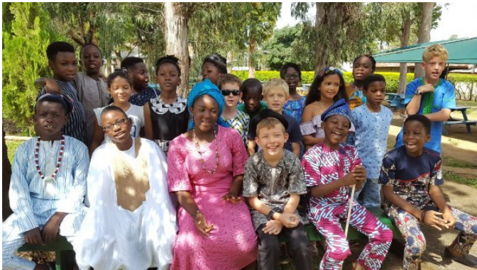
Celebrating Nigerian Independence day wearing different traditional clothing.