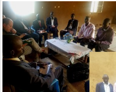
Meeting with the national officers of the Reformed Lutheran Church of Rwanda