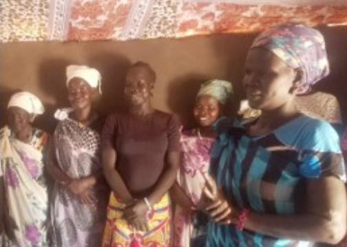
Sudanese refugees; inside a church at Nyumanzi camp; women who received our delegation by washing out feet!