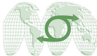
"from everywhere to everywhere"

At GLO, we like to say that now is the time for it to be "from everywhere to everywhere."