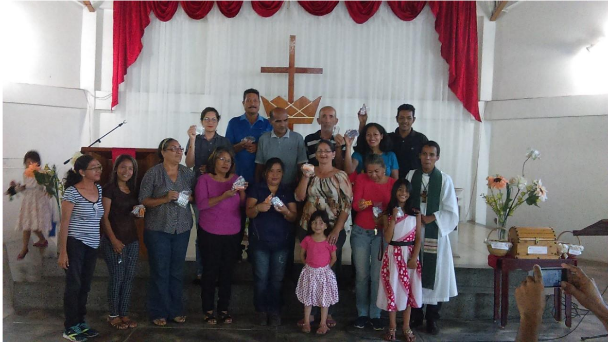
1 Monagas state