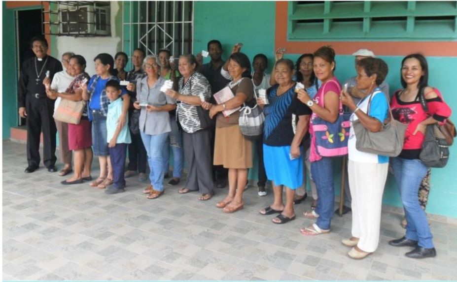
San Felix, Bolívar