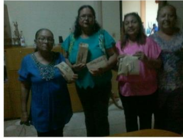
Puerto Ordaz, Bolívar