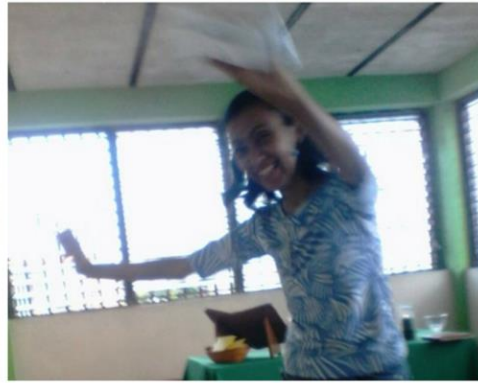
Caracas, Distrito Capital