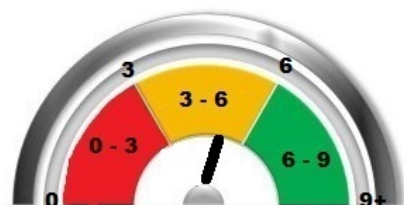
Financial Support Level

Months of ministry funding currently on hand: 5.0