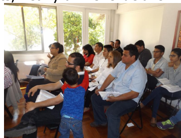
Last Sunday worship with 23 in attendance