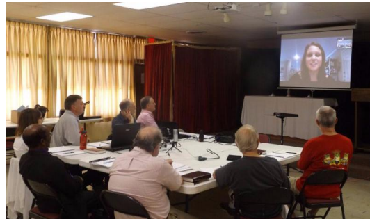
GLO board hard at work!

culturally, you can get more information here.