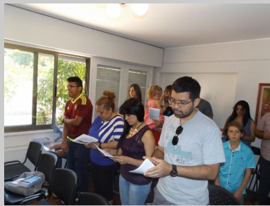
Our mission congregation in downtown Santiago

* We praise God for touching the lives of several new "future GLO missionaries". We pray for their preparations to follow God's calling in the world.