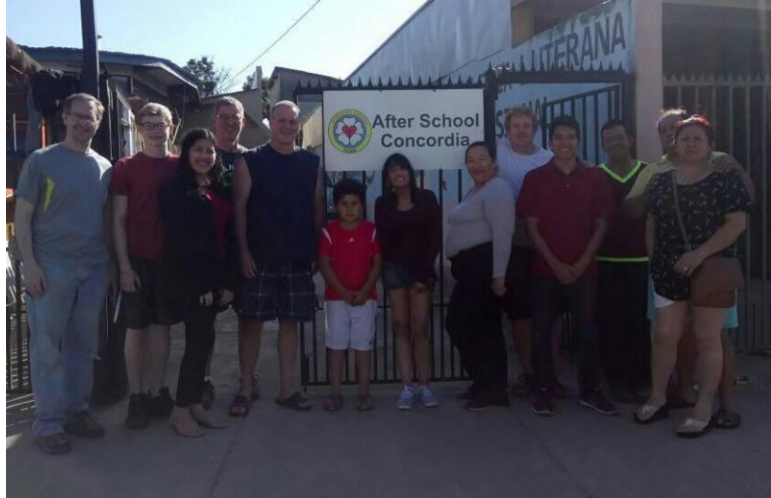
The multi-national team at Constitucion, Chile