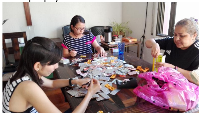
Church volunteers in Santiago sort and package medicine for shipment to Venezuela

Last year, in partnership with Lutheran World Relief and the Lutheran Church of Chile, we initiated a project to send medicine from Chile to Venezuela. It is an enormous undertaking! We receive requests from the congregations of the Lutheran Church of Venezuela; we purchase the medications in Chile, package them, and mail them to each congregation in Venezuela, where they are distributed to the "patients". We have received so many expressions of gratitude, it is truly heartbreaking. All of this is managed through our small mission congregation in Santiago! To learn more about the project, you can click here. Please pray that we can also give the "medicine" of the Gospel to the immigrants in our midst!