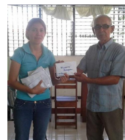
Lutherans in Venezuela receive medicines from Chile

In a previous newsletter, we talked some about the number of Venezuelans who are immigrating to Chile. The horrendous situation in Venezuela has only gotten worse over the past year. Hyperinflation (over 2600% in 2017) has eroded the purchasing power of citizens and has caused many industries to abandon their operations. As a result, food is scarce or priced out of reach of the average Venezuelan, and medicines are non-existent. Even simple items like aspirin are no longer available. The lack of medicine creates a crisis for those who suffer from "routine" infirmities such as high blood pressure or diabetes and creates a life-or-death situation for people with more serious conditions such as epilepsy.