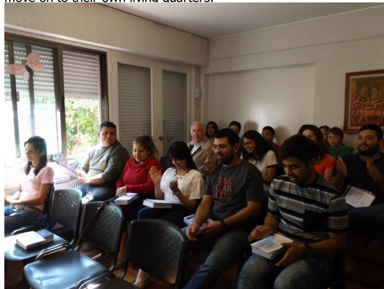
Sunday morning worship

We continue to work at our new church planting ministry in Santiago. We are about 8 months into it now, and have a core group of close to 20 people! Praise God! We are now starting to plan out some "next steps", which might include renting a new location for the church (the church currently meets in our house). We also continue with the immigrant ministry, providing temporary lodging, orientation, and some home furnishings when our "guests" move on to their own living quarters.