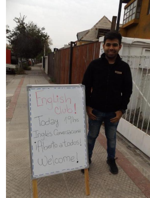
One of our English Club participants