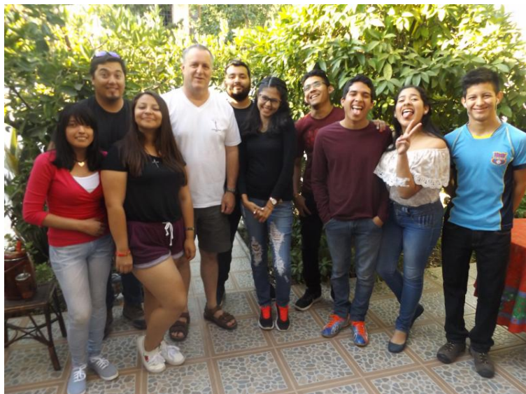
Later in the month we hosted a youth night with