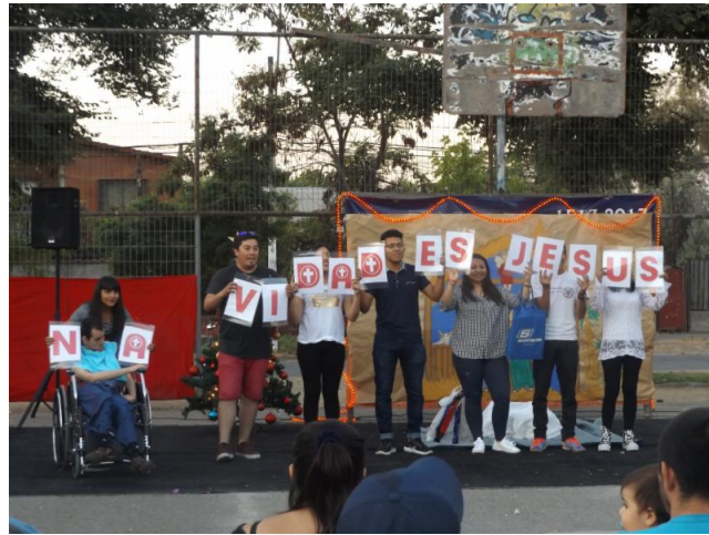
The sign reads, "Christmas is Jesus"

* PRAISE GOD for his provision for all that we need as missionaries in Chile. THANKS TO ALL OF YOU who made generous donations in December and January!