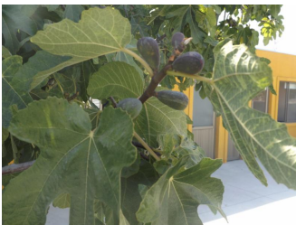
Fig trees here have two harvests. We just gathered the first figs, or "brebas" in January. The rehab students participated in a cooking workshop where they learned how to prepare "dulce de higo" (candied fig). After cleaning the figs, they were ground up and then cooked for a long time until reaching a pudding-like texture. The result was similar to the sweet, gooey filling of a "fig newton". The next crop of "higos" (figs) should be ready in March!

Fig trees are common in the Bible...and also in Chile! We even have an "Higuera" (fig tree) at Casa Betesda (above picture). Now that this tree has received some pruning and regular watering, it is thriving!