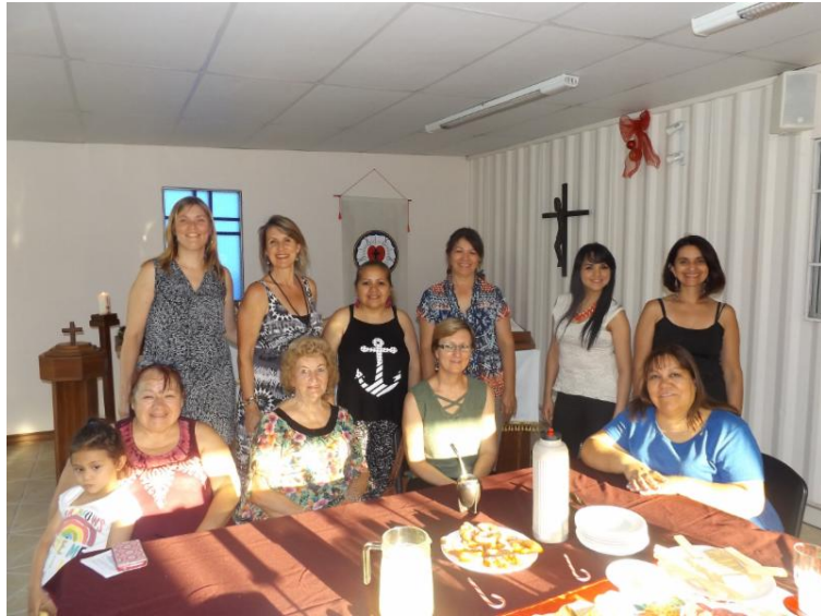
The Ladies of both congregations had their Christmas Tea at our "mother church" location in La Florida.