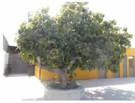
Fig trees are common in the Bible...and also in Chile! We even have an "Higuera" (fig tree) at Casa Betesda (above picture). Now that this tree has received some pruning and regular watering, it is thriving!

Fig trees here have two harvests. We just gathered the first figs, or "brebas" in January. The rehab students participated in a cooking workshop where they learned how to prepare "dulce de higo" (candied fig). After cleaning the figs, they were ground up and then cooked for a long time until reaching a pudding-like texture. The result was similar to the sweet, gooey filling of a "fig newton". The next crop of "higos" (figs) should be ready in March!