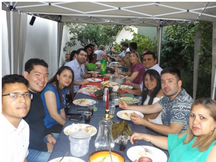
Since our new mission includes many Venezuelan immigrants, we had a traditional Venezuelan Christmas dinner in the backyard of our house-church.