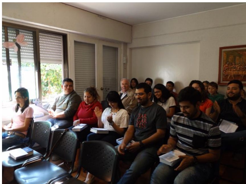
Sunday morning worship

Our immigrant ministry is going strong, but it is also presenting us with a financial challenge. Up to this point, we have been financing the ministry out of the generous contributions given for our personal support. However, the ministry has grown to the point to where the real cost is about $1000 per month, which is putting a severe strain on our finances. We applied for a grant to subsidize the ministry, but unfortunately we did not get the grant. We are looking for God to provide a total of $12,000 for the next 12 months of operation of the ministry to immigrants. If you are interested in supporting ministry or learning more about it, click here .