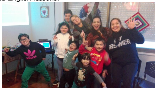
English Club rocks!

Children from 7 to 13 years old participated and learned, and by the end of the week they were able to greet, introduce themselves, name the parts of the body, identify the seasons, name animals and colors - all in