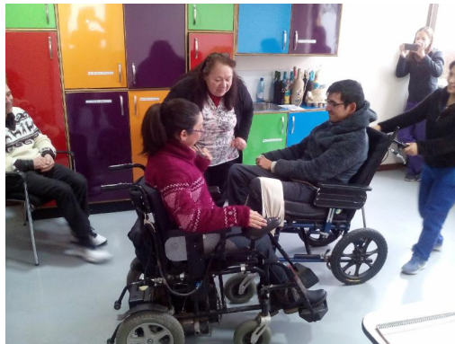
Casa Betesda patients learn to dance cueca !

"Casa Betesda" rehabilitation center continues to make a difference in many peoples lives. Thanks to a grant given by brothers and sisters in Cabot, Pennsylvania, we are able to employ the director of special education, an assistant, and 2 therapists. Several of us volunteer our time