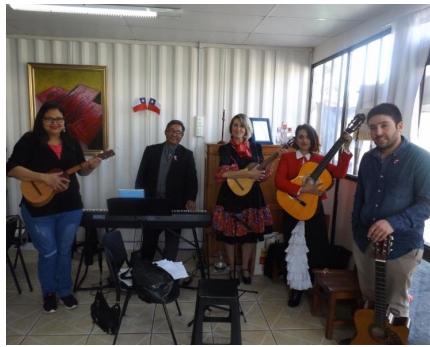
Musicians for the special worship service!

Choice Dollars charitable grant funds make a world of difference to missionaries through our Global Missionary Fund , which supplies dollars to missionaries who experience a shortfall in funding. Directing Choice Dollars is easy. Simply go to: Thrivent.com/thriventchoice to learn more and find program terms and conditions. Or call 800-847-4836 and say "Thrivent Choice" after the prompt.