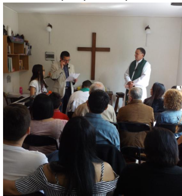
Presentation of anniversary gift

our awesome God for making it all happen! And, we thank so many of you who are a part of this "team" and support the mission, prayerfully and financially.