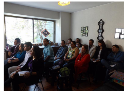
More people in the adjoining room!