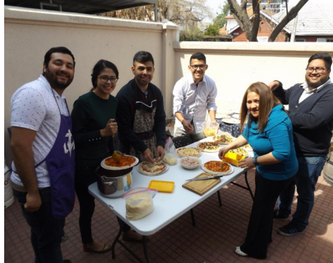
Immigrants taking charge of the pizzas!

We constantly share with you about our ministry to immigrants. It is important that we include how immigrants minister to us! A character trait found in many Venezuelans is a humble attitude of service. We saw this in action on the anniversary weekend as our Venezuelan friends were cleaning, making pizzas, serving food, and cleaning some more.