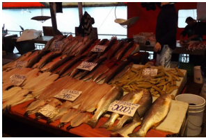
Fish at the market