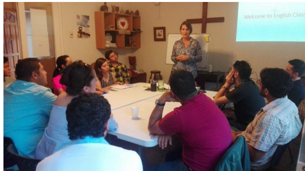
English Club rocks!