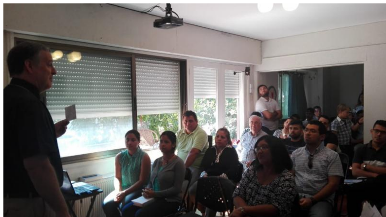
Sunday morning worship. We have expanded into our living room!

If you are interested in supporting our immigrant ministry in Santiago or learning more about it, click here .