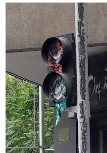
Can you figure out what this is?

As you have probably seen or heard in the news, Chile has been in a state of chaos since October 18. What started as a protest against an increase in bus and subway fares, became a warzone for a plethora of grievances and claims of "inequalities". We say a "warzone" because even now, a month later, you see burned-out buildings, graffiti covered historic buildings and boarded up businesses throughout the city. Manifestations - sometimes violent - break out almost daily. Roads are blocked. The subway stations are shut down. Business hours and the school day have been shortened for safety reasons.