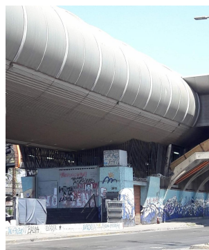
Burned and graffiti-covered metro station

The government is trying to control the outbursts, but still the people continue to protest. Fortunately, we live in a more peaceful part of town, so we can avoid some of the "ugliness". However, our mother church in La Florida is in the middle of one of the rebellious areas. All the grocery stores and metro stations close to the church are still closed because of the excessive damage. Pray