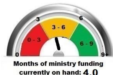
Financial Support Level

To support our ministry online, click here. One-time or automated contributions are available.