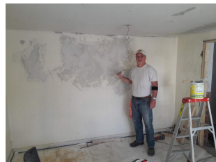
The apartment, BEFORE.

JOIN US IN PRAISING GOD for completion of several projects despite the challenges of Covid-19 restrictions! The apartment over the garage at the back of the mission property is complete. It is a cute studio apartment with an open living space and a good-sized laundry/bathroom combo.