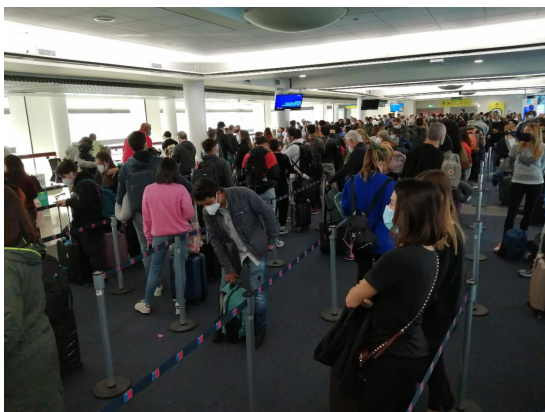
ABOVE: The line at the airport to show our papers and register for quarantine.