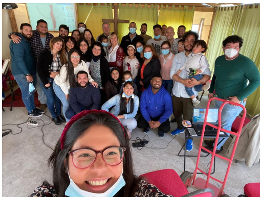
ABOVE: Most of the congregation gathered for our anniversary celebration worship!

(P.S. The hand truck is what we use to hold the camera for recording the sermon! Nothing but the most advanced technology here!)