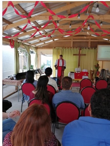
ABOVE: Reformation service is underway!

The congregation planned an afternoon of fellowship with a meal of Arroz con Pollo and a "Luther Rose" craft. A neighbor, who visited church for the first time, said he didn't know there were Christians close by who had a Reformation Service. We pray that he accepts our invitation to come back! And THAT is reason enough for Thanks!