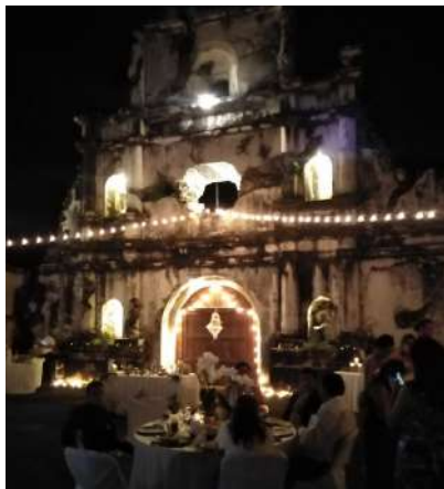
Below: The reception venue.