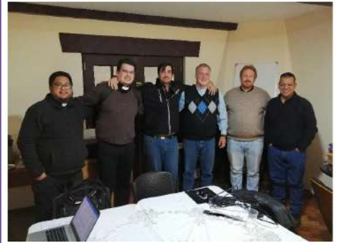
Bottom: Pastor's meeting