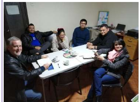
Top: Congregational board meeting. Bottom: Pastor's meeting