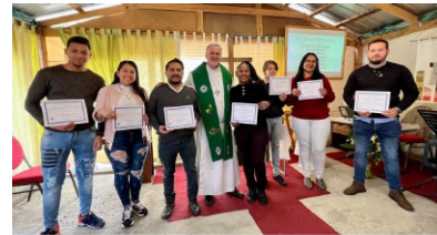
Top: New confirmands receive their certificates.