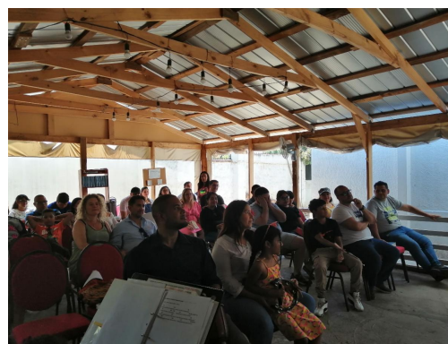
BELOW: Full house in Santiago on Sunday morning!